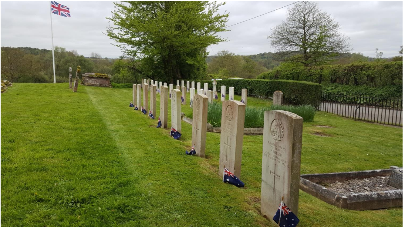
St. Edith's Churchyard, Baverstock