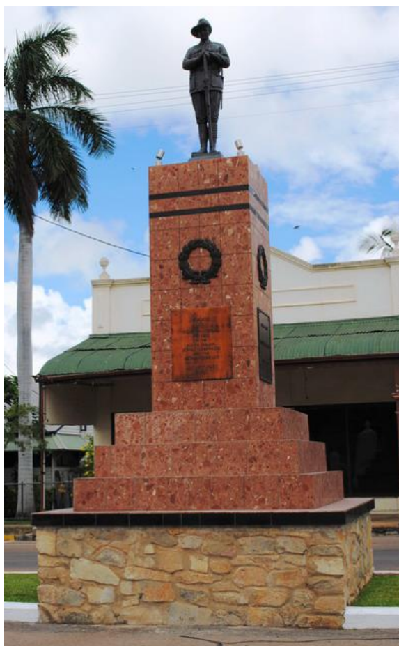
Charters Towers War Memorial Cenotaph

The Charters Towers War Memorial Cenotaph, located on Gill Street, Charters Towers, Queensland does not have individual names listed.