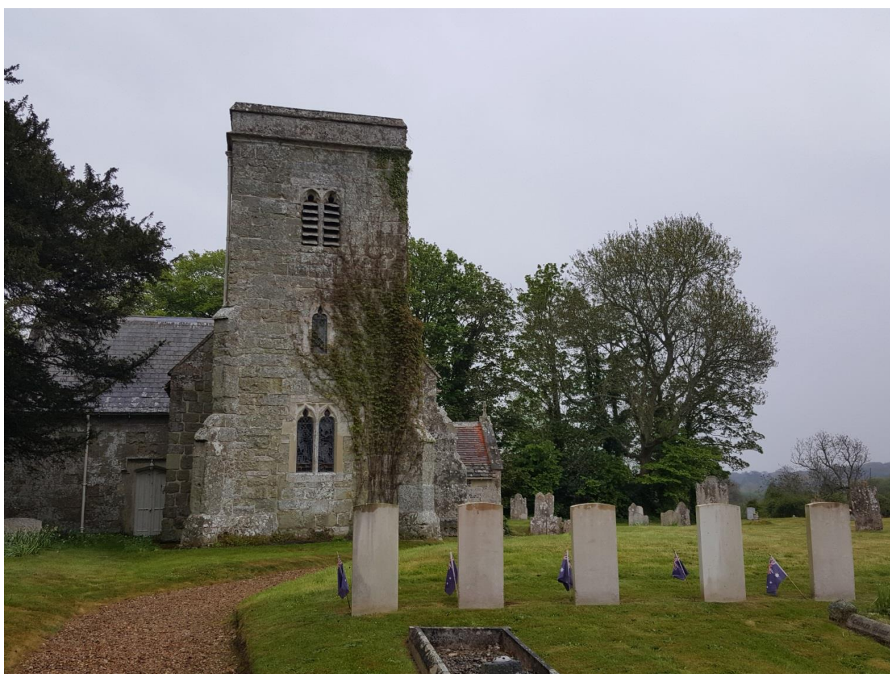
St. Edith's Churchyard, Baverstock

St. Edith's Churchyard, Baverstock contains 32 World War 1 War Graves – 3 London Regiment Graves in the south-west corner & 29 Australian War Graves.